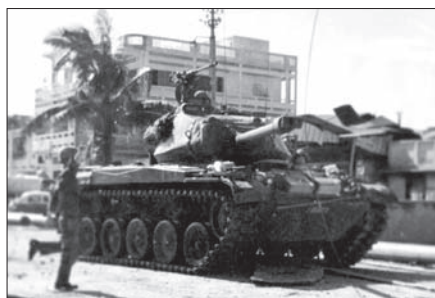
Vietnam, May 1968