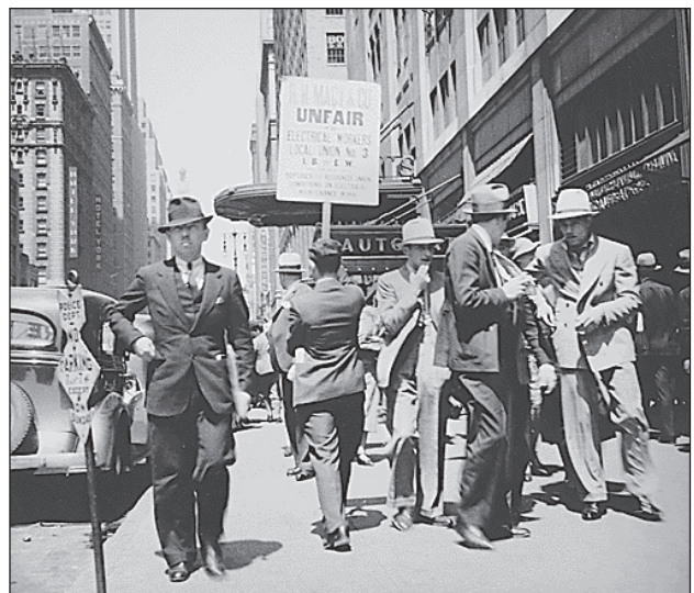
Union men picketing Macy's.