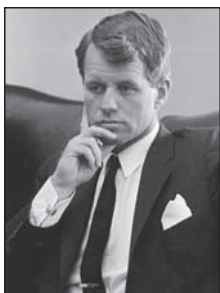
Robert Kennedy